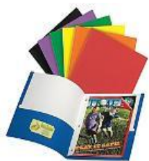
Three-prong portfolio with two pockets