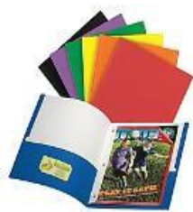
Three-prong portfolio with two pockets