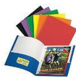
Three-prong portfolio with two pockets