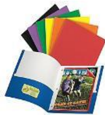
Three-prong portfolio with two pockets